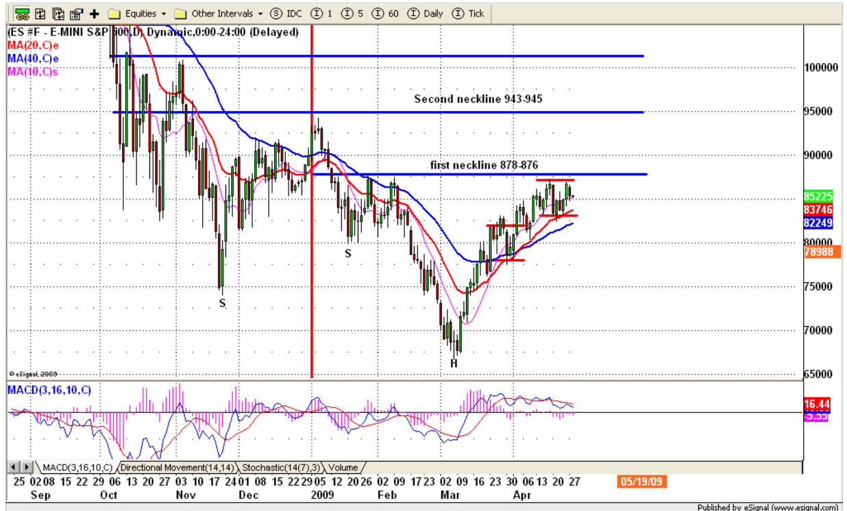
ESM9 DAILY Chart

ES continues its consolidation. It seems 872 is acting as a strong resistance level for the past week. Today we may see ES go sideways for one more day if it can't breakout 872 level or it may run ahead of tomorrow GDP report and FOMC interest rate announcement. Based on yesterday's price behavior, it seems upside will soon run out of steam.