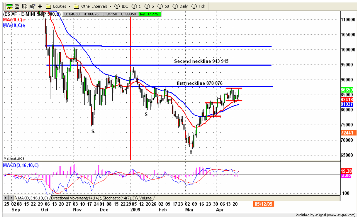
ESM9 DAILY Chart

Today there may be a retracement from last Friday's high to retest Friday's low 852.25 area or lower to fill Friday's gap 848.75 area. But as long as 820 line holds up, the price could be pushing back up to the highs. 872-876 is key range for upside. A break above 878 will be bullish; then the odds will favor a move to 882-886 and perhaps much higher to the 913-916 range.