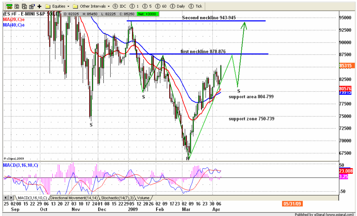
ESM9 DAILY Chart

This week is option expiration week, plus lots of important economic reports and many earning reports. Choppiness and high volatility should be expected.