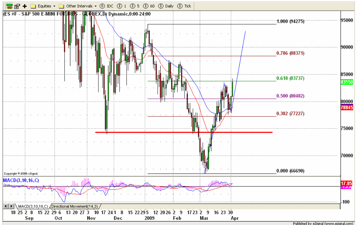
ESM9 DAILY Chart

Today if the economic report is within expectation, ES should stay at high for weekly closing even if it attempts to retest 804 level in the early morning session.