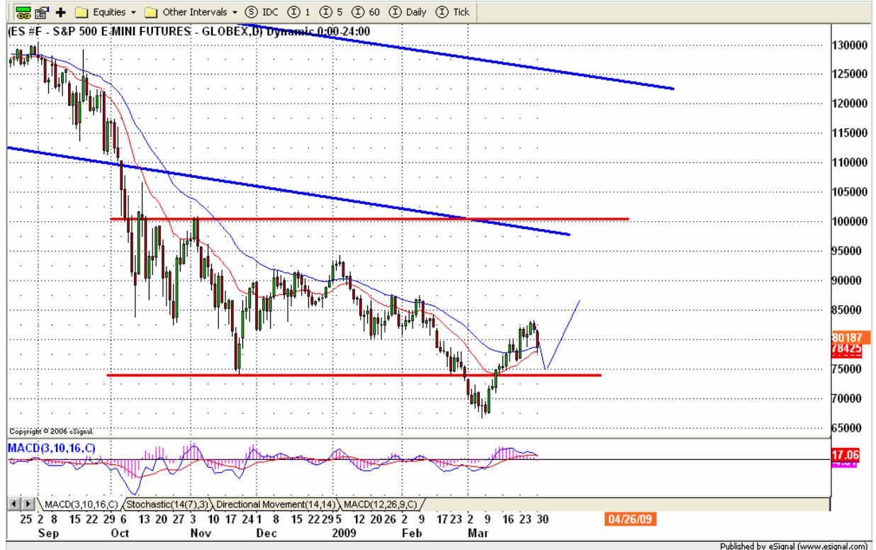
ESM9 DAILY Chart

Yesterday's downside is a short-term correction after a big run up. This downside correction could be ended around yesterday's low or lower to 750-725 until ES finds a new equilibrium level.