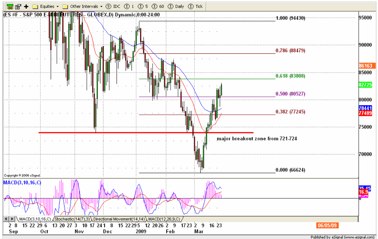
ESM9 DAILY Chart

The economic report showed some improvement in GDP, Housing, and Durable Goods. This continues to encourage aggressive buyers and promote short covering. The short-term uptrend is strong, it is possible to continue to higher level for weeks or perhaps months.