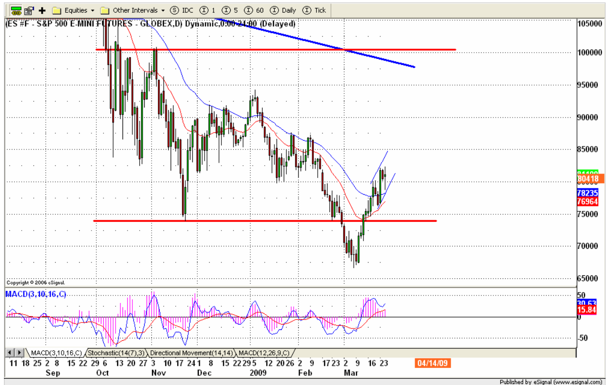
ESM9 DAILY Chart

Some normal profit-taking smoothed out the short-term overbought condition yesterday. At the end, the heavy buying interests quickly exceeded the day's selling and pushed price back above 800 line. This type of movement is bullish and indicates the uptrend remains intact.