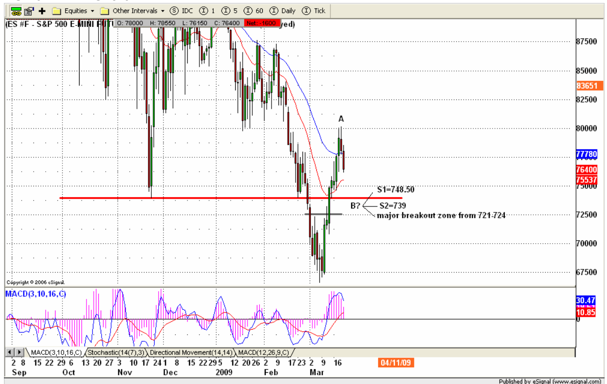
ESM9 DAILY Chart

Step by step. First for today we should pay attention on how low ES could go. Below the current price, there are three major support levels (748.50, 739 and 721-24; see chart). The price could bounce from each of those support levels. There was a major breakout movement at 723.50 level last week. A move below 721 line will be negative. As long as ES doesn't breach last major support zone, BUY ON DIP still is our strategy in the coming days.