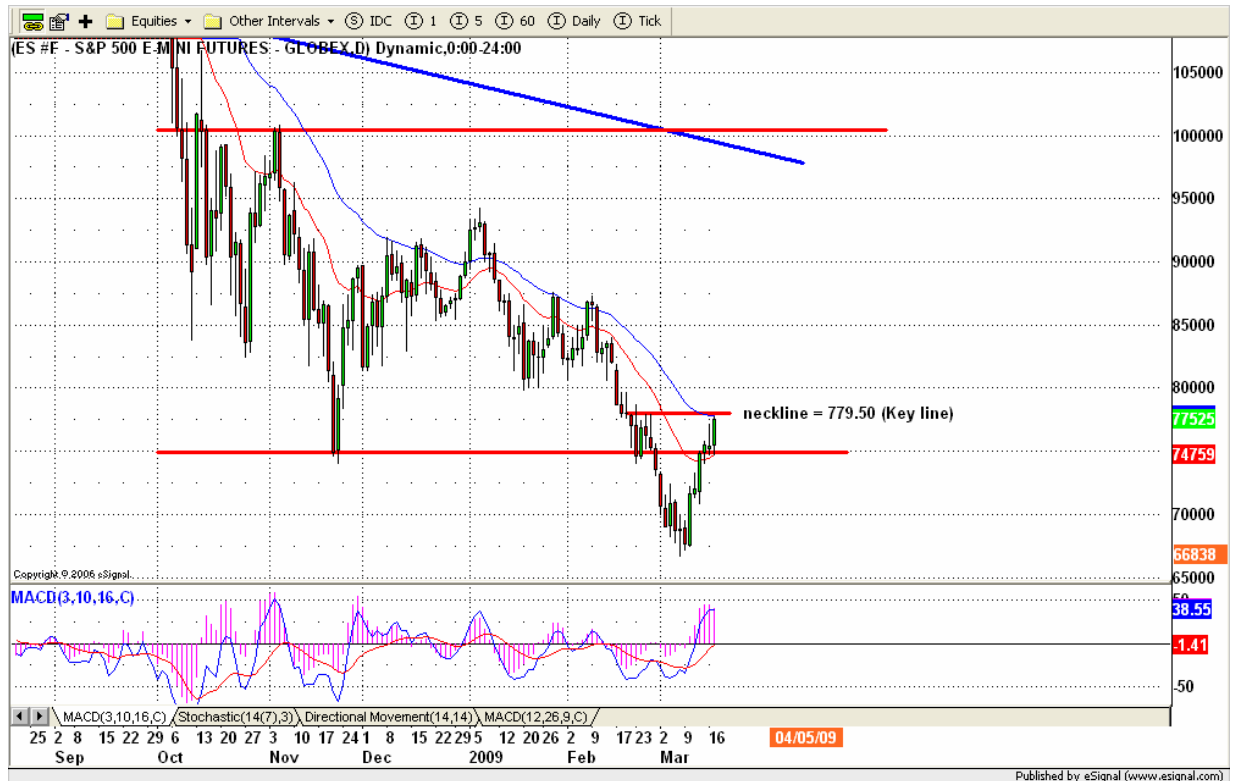
ESM9 DAILY Chart

ES continues holding above last year's low and challenges long-term major resistance level (40 daily moving average line). Today is FOMC day and the street expects the interest rate to be unchanged. If the announcement is within expectation, it is possible for ES to dip first and moves back later.