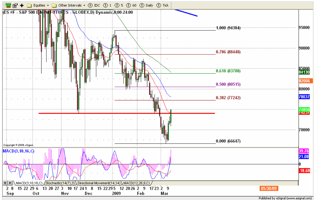
ESM9 DAILY Chart

The price had been pushed back above last year's low yesterday, and ES managed to hold the gain to close near the top of the daily range. Especially in latter part of the day, the price showed momentum into the close. That indicates this morning we may see price continue moving higher.