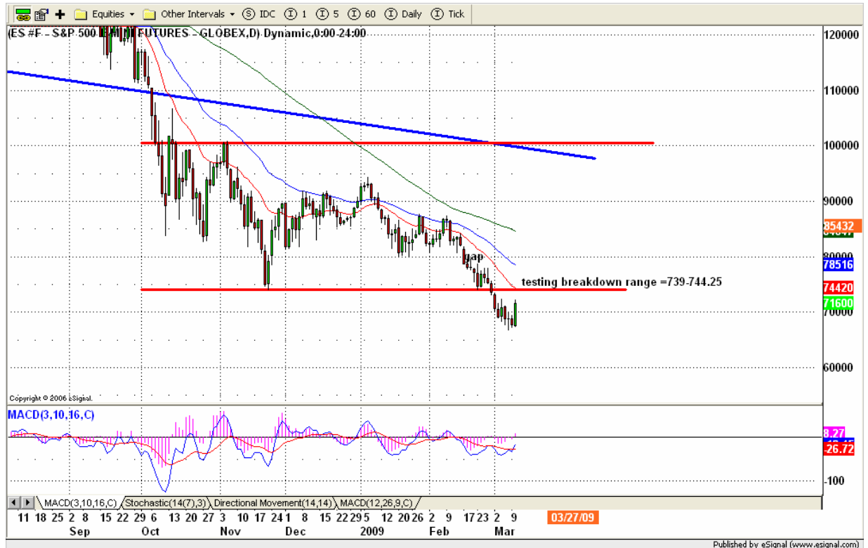
ESH9 DAILY Chart

ES had more than 5% gain in yesterday's trading. It is likely to move higher to retest last year's low 739 and last bear market's low 768 area.