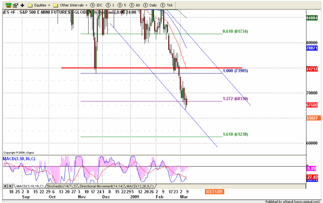
ESH9 DAILY Chart

In the past days, each rally didn't live very long. And after the rally market sentiment gets extremely bearish, and the price gets extremely oversold. More and more news reports speculate on how low price will fall, but the price still made small bounce. This type of behavior seems to tell us that ES is searching for major support and will rally from it, perhaps this week or next.