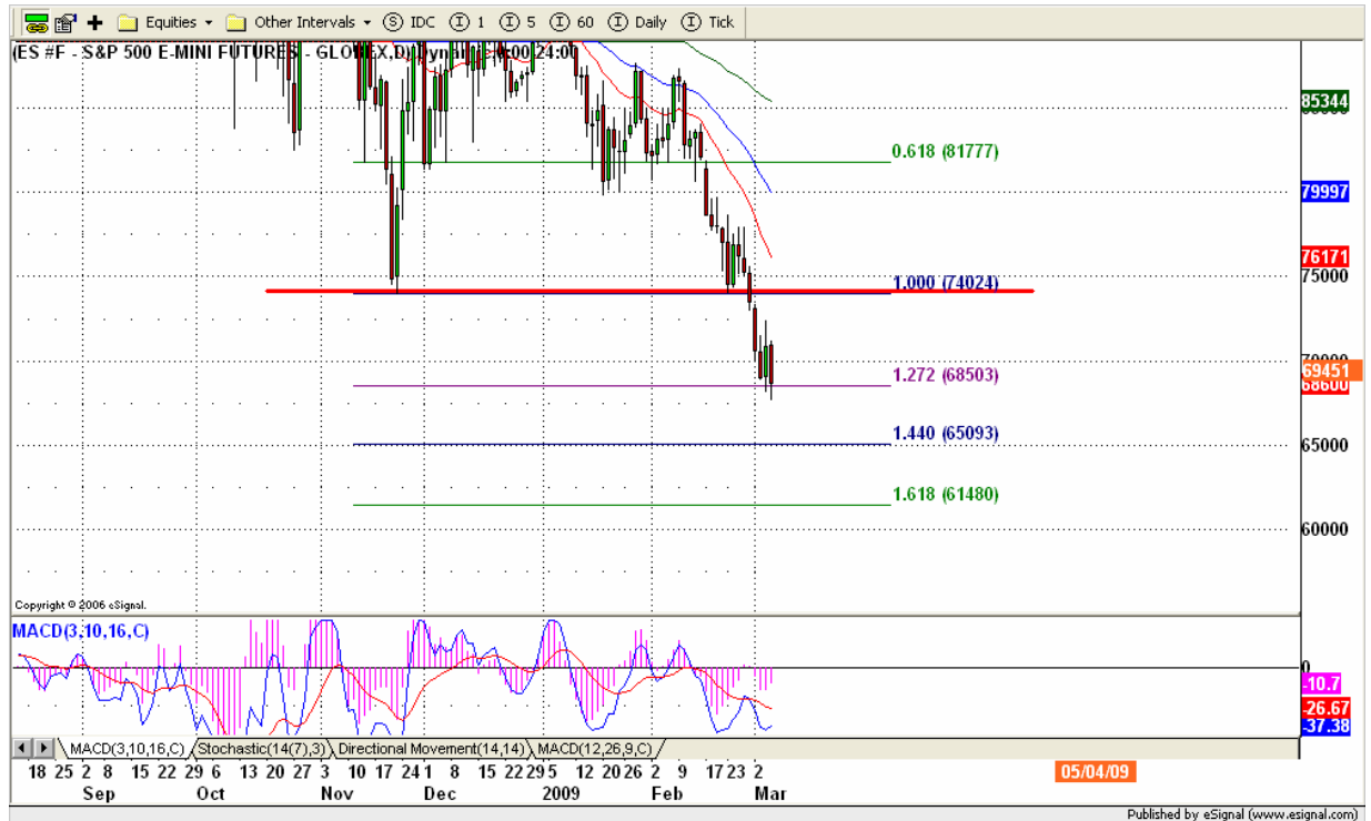
ESH9 DAILY Chart

Based on the daily chart, 706.50 line failed to hold price up yesterday and the price continued to fall below 698.75 line to re-trigger the selling button. The price hit first potential extension support level to make a new low around 681-677 area before ES bounced up for closing. Today if unemployment report is out of market expectation, a further low should be expected.