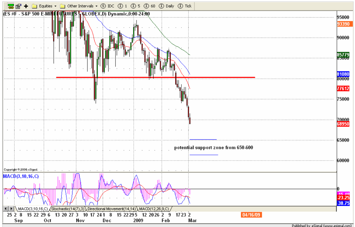
ESH9 DAILY Chart

But all three major indices reached extreme oversold levels. All of them are approaching their potential support levels. For the ES there is support zone 650-600 range beneath current price. A sharp push down followed by a sharp reversal up should be expected anytime from today towards next week. As long as there is no unexpected news to disrupt this market, a counter-rally could be seen soon when the price get close to that potential support zone.