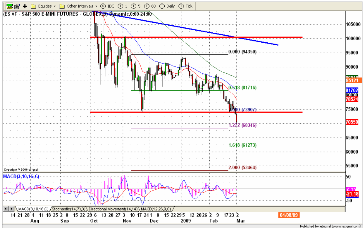
ESH9 DAILY Chart

A small profit taking bounce should be expected. But a little further down to 683.50 or lower to 652.75 could still be seen. These days it is reasonable to expected the unexpected, and the surprises have all been negative for some time. Investors may be waiting for a reason to buy, but they are not getting much encouragement.