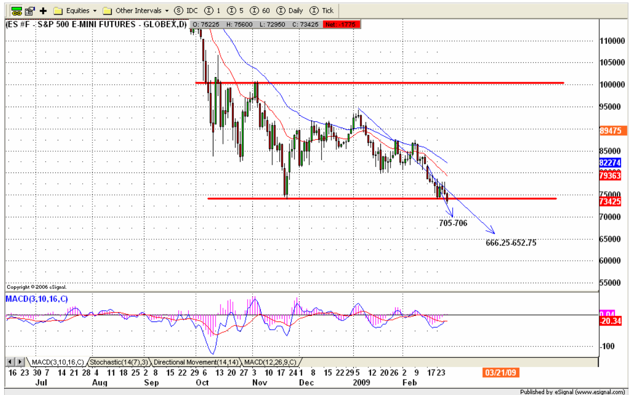
ESH9 DAILY Chart

Based on daily chart, ES broke last year's low 739 line and closed under it. The price seems to already break down the previous support line, and a further decline to 706-704 or deeper to reach 666.25-652 range is possible in the coming days. A small CIT day is around Mar 5 or the following week. Also ES is near the first impulse declining wave low area. We need to wait for ES to show the strength on upside before we enter the buy side aggressively. But we also shouldn't short too aggressively on the new low level. We are at or near an inflection point.