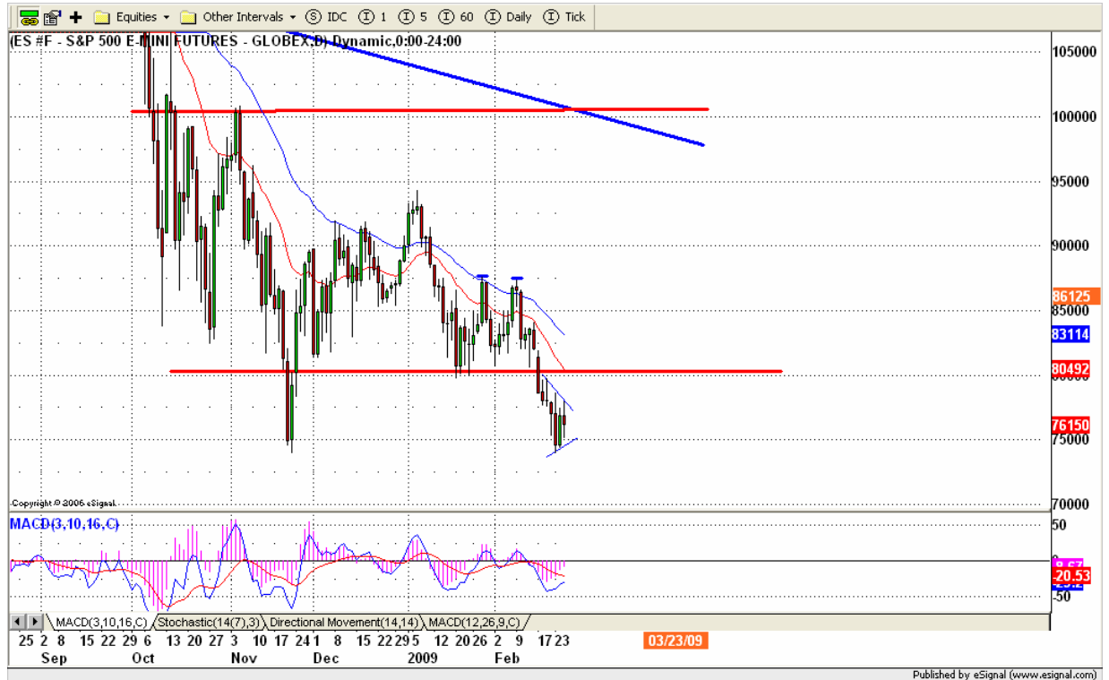
ESH9 DAILY Chart

Two days of Fed speeches made the sellers nervous. ES trades into a consolidation triangle pattern. Today Economic reports will dominate the market. If those reports meet optimistic expectations, ES could go back up to retest yesterday's high 779.50 or go higher 786.50. But based on the daily chart, it still lacks of one push down to complete the first major impulse declining move.