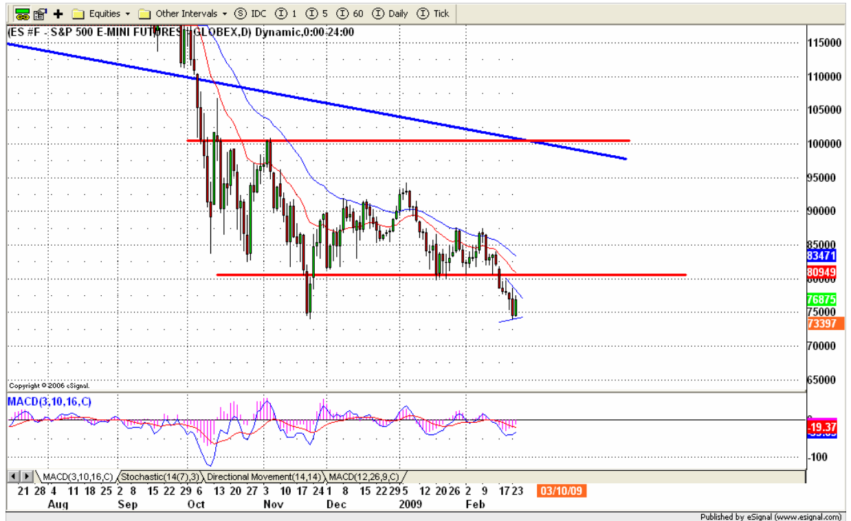
ESH9 DAILY Chart

ES made an inside day -yesterday for consolidation after 9 declining days. Today we may see a further up move in the morning due to Ben has one more speech at 10am. If there is no particular content in Ben's speech, we may see price continue traveling back into yesterday's trading range. If the market favors his speech, the price may go up further to fill 779.50 gap and retest 786.50 high. But no matter how high ES goes up, it shouldn't exceed 808.50 line. The price needs to stay below that line to remain downside to complete this last impulse downside wave.