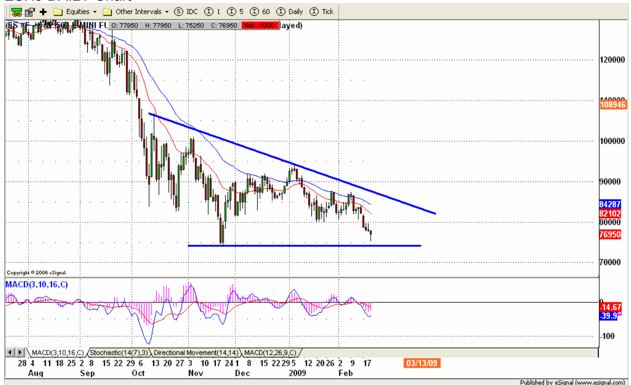
ESH9 DAILY Chart

Based on daily chart, ES is forming a descending triangle. We may see short-term bounce today due to oversold condition. The price could move up to last week's high area for maximum bounce. But this bounce shouldn't exceed 821 line. This line needs to hold ES down for breaking down 739 line to get to 652.75 destination.