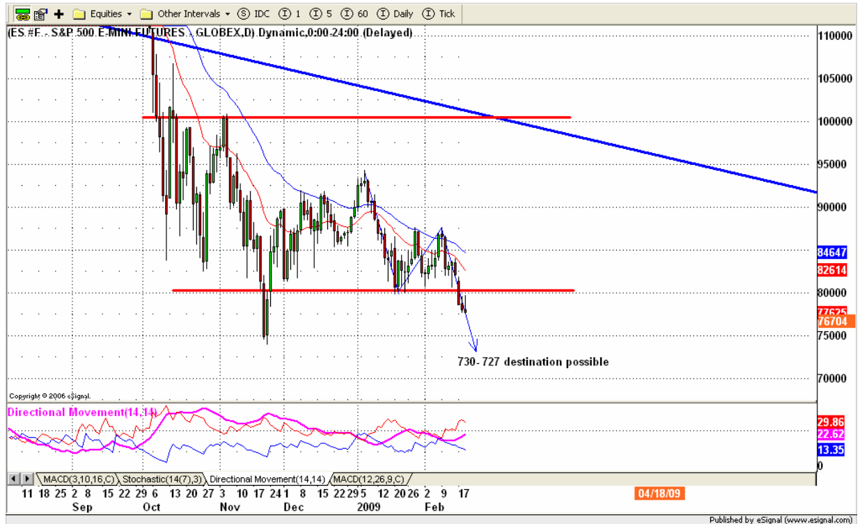
ESH9 DAILY Chart

We hold our bearish tone today again as long as price doesn't exceed 796.75 line. The downside targets (773 or 730-729 or 652.75) still should be paid attention today.