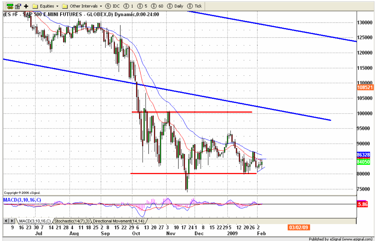
ESH9 DAILY Chart

Today there is the unemployment report in the early morning, plus the stimulus plan news. If the results are not expected by the market, yesterday's gain may return to the bears again.