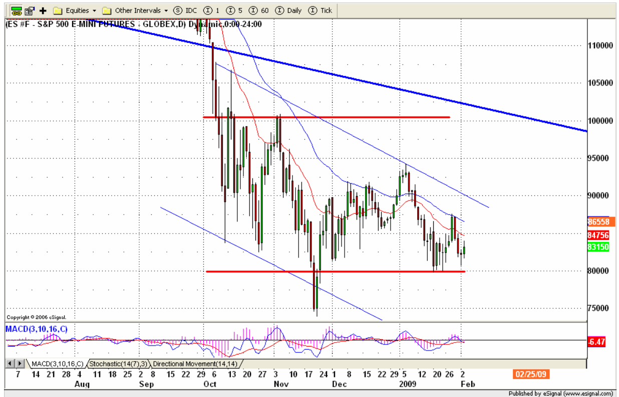
ESH9 DAILY Chart

There is not much change in the daily chart on ES. ES still is struggling with holding the psychological support. Only it has changes on $DJIA. It moved back above 8000 line. If DJIA can continue holding above 8000 line, it will be difficult for ES to go down. In the meantime, if DJIA goes below 8000 line again today, it will be bearish sign for the market. Usually it can create a fast downside move.