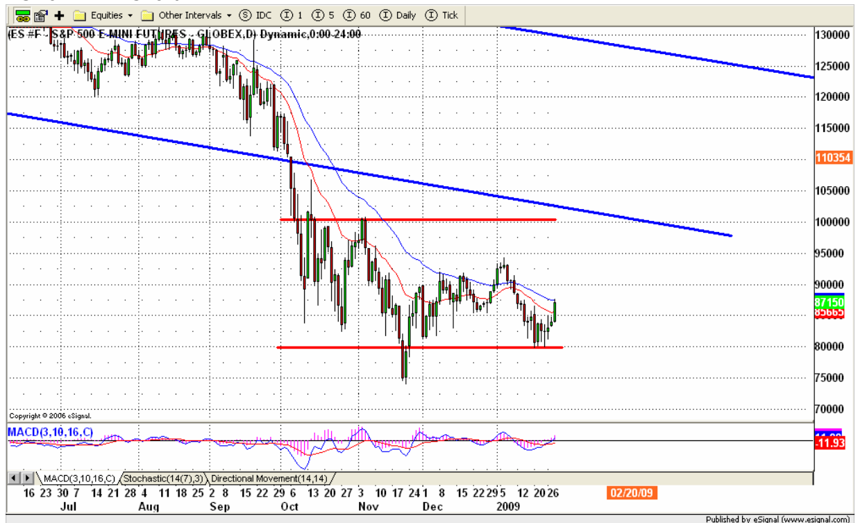
ESH9 DAILY Chart

Hope overcomes fear. It looks the market found its support. But it hasn't walked out of woods yet. Based on daily chart, ES still closed below 40 days moving average line. If ES closes below 856 line today, yesterday's rally will be considered a only bounce. Only an ES close above 875 tomorrow will encourage more buyers to step into this market. Otherwise, every bounce will lead to previous buyers existing.