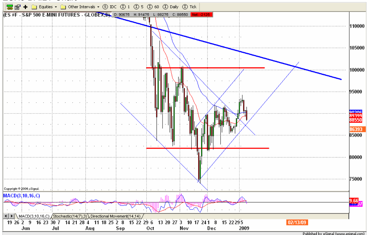
ESH9 DAILY Chart

Nothing in that move should surprise our traders. ES went into its normal trading pattern. Today we may see a continuation down to hit our major target to complete the pattern before ES bounces back up again. The area around 864-862 where uptrend and downtrend lines cross is very importance today.