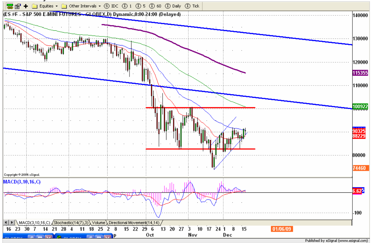
ESH9 Daily Chart

ES was caught between 20 and 40 daily moving average lines. It mainly consolidated Tuesday's rally. Today as long as 882-880.50 range holds ES up, short-term uptrend remains intact, The buyers will continue fighting for higher move to complete a-b-c pattern in the coming weeks.