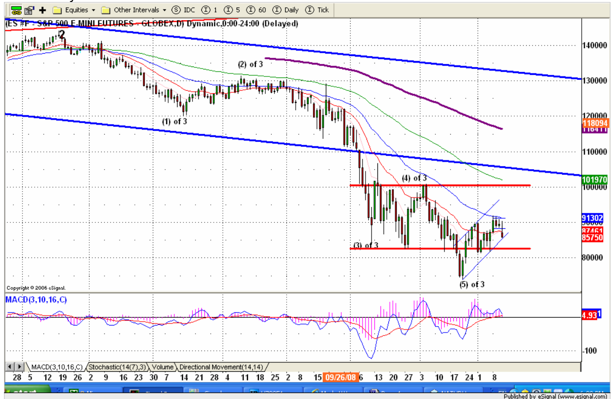
ESZ8 Daily Chart

Bad news (Bank of America) was out again and on first day sent our new ES contract under 20 day moving average line again. A Daily Grail Sale has been setting up again. As long as Bears hold below 913.50 line, the holiday bounce will become tough and tougher. If ES goes below 813 line, it will destroy all hope of holiday bulls.