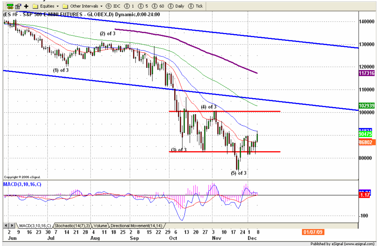
ESZ8 Daily Chart

Upside correction move is in process. As soon as ES manages to break above the 40 day moving average, a substantial higher move should be expected. Holiday sprit could push ES above 970-950 or higher to 1044-1029 range this month.