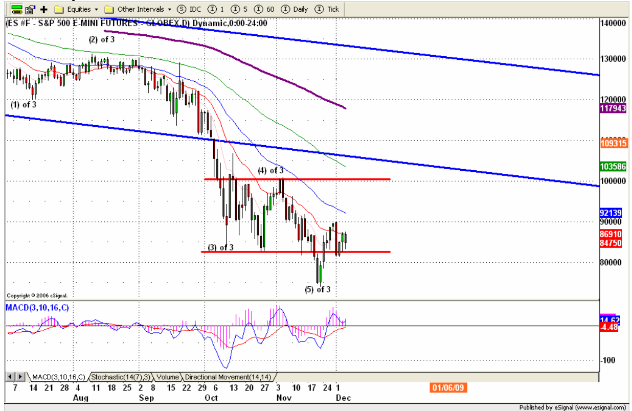
ESZ8 Daily Chart

ES had a pullback after it made a peak in the early morning. Today we may see ES continues to struggle with 20 day moving averaging line and try to hold price up above 818 area.