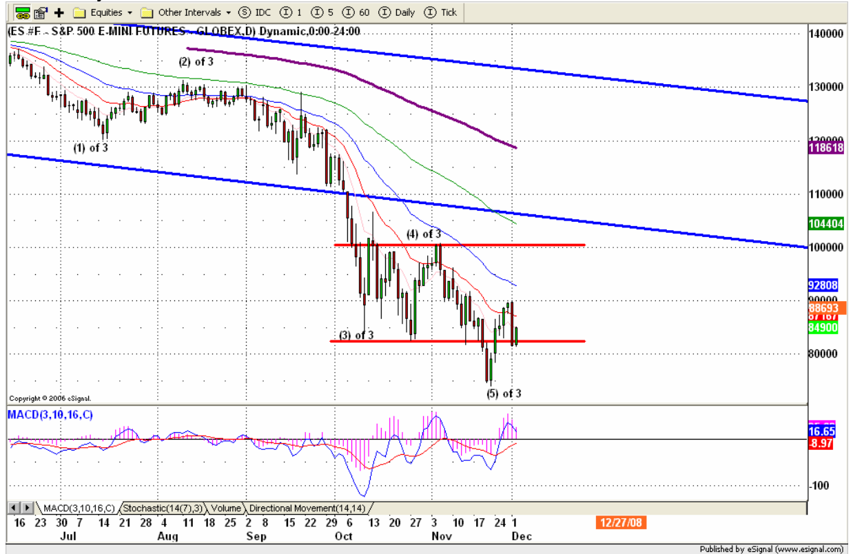
ESZ8 Daily Chart

ES managed to bounce back from its previous loss and intended to push price back up. If today ES can hold yesterday's intraday breakout level 831.75-830.50, a further upside should be expected.