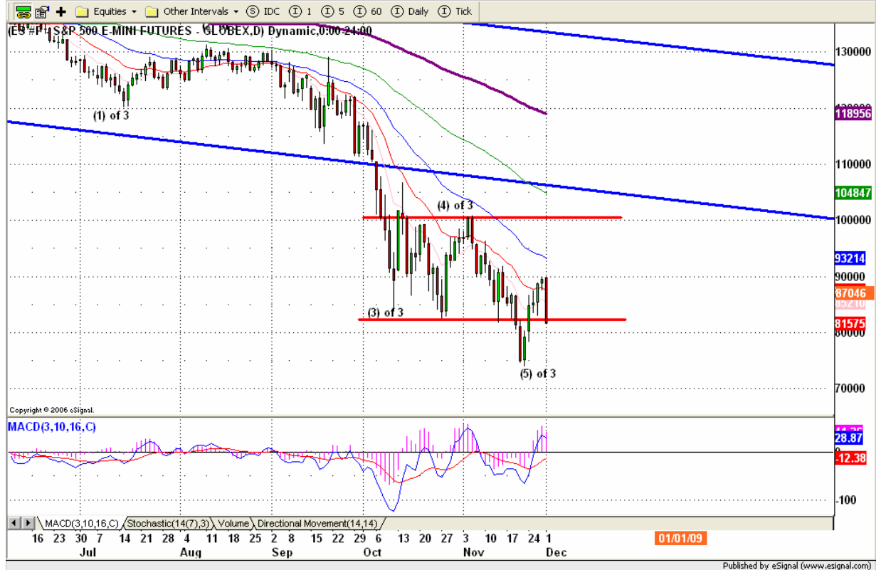
ESZ8 Daily Chart

ES pulled back down below 20 day moving average line for closing yesterday. On the daily basis, there is a Grail Sell setting formed. As long as 870.50-855 range holds ES down, the price could be pushed back into downtrend channel again, (This downtrend channel is moving toward a further decline to the 664 area.) But if 800-798 range holds ES up today, ES has one more chance to push price up to retest 20 and 40 daily moving average lines.