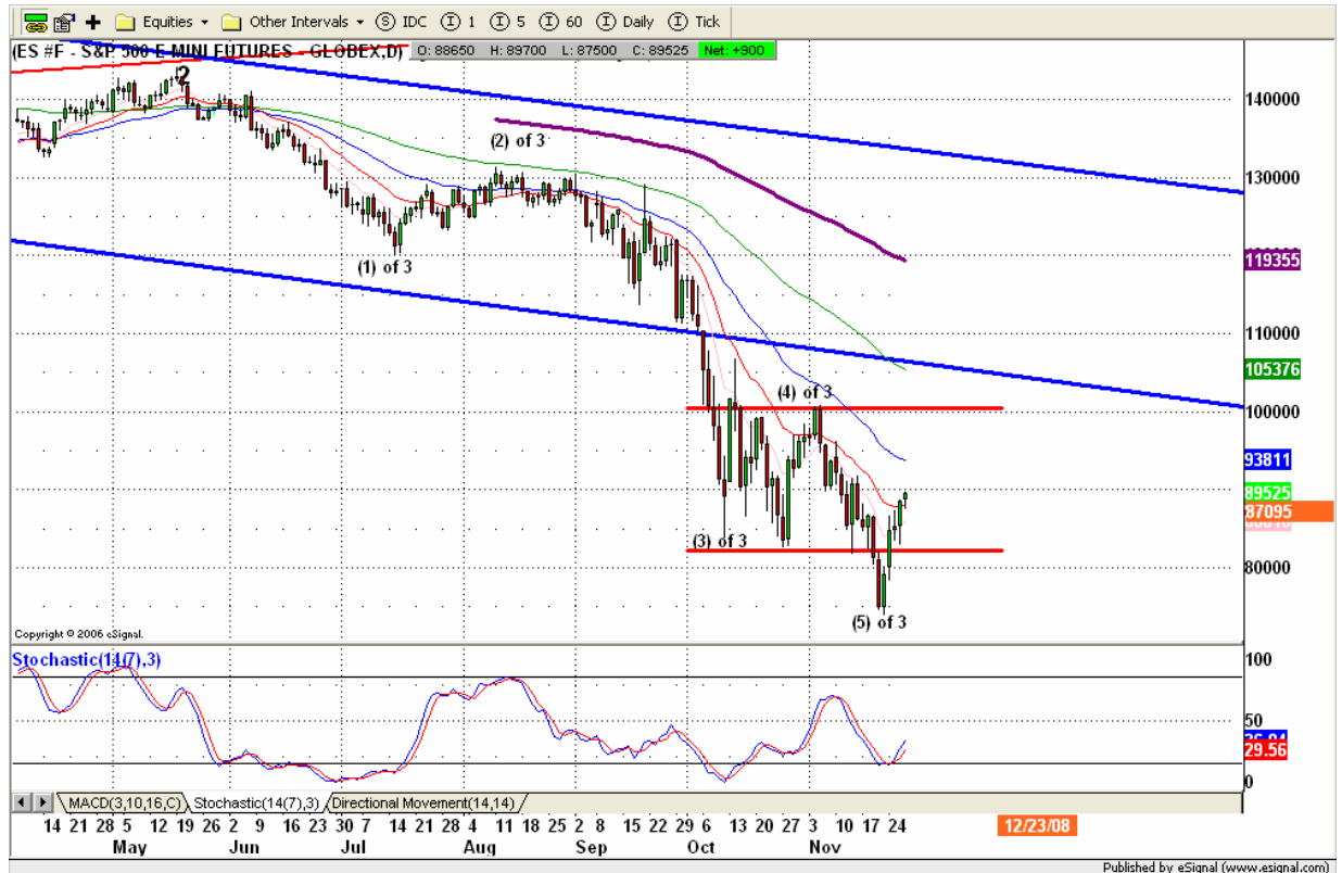
ESZ8 DAILY Chart

Based on the daily chart, ES closed above 20 daily moving average line for the first time since early last November. Momentum may keep pushing price higher to 40 daily moving average line area. A move above 918 is bullish, and would make a continuation to 950 area more likely. A break below 855 is bearish, and there is a chance for ES to go lower to 829-825 range.