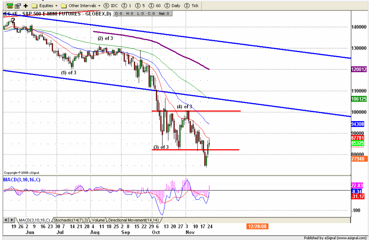
ESZ8 Daily Chart

ES paused around first major daily resistance 877.75 area. Today is last trading day before Thanksgiving holiday. The volume was already reduced 9% yesterday, and it will continue drying up. The price will swap both directions again. So stay tuned.