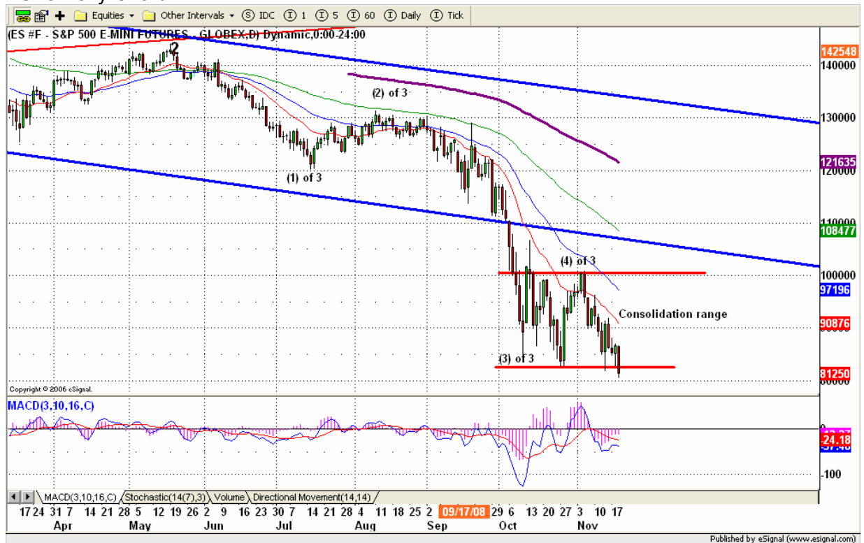
ESZ8 Daily Chart

Option expiration week makes for high volatility moves. In addition the bad economic news and the auto industry struggle for survival put big pressure on investors. Finally the market collapsed in the last hour trading and sent the price to the low for closing. Today is option expiration day and also it is Friday. We may see a small bounce with sideways move to the end.