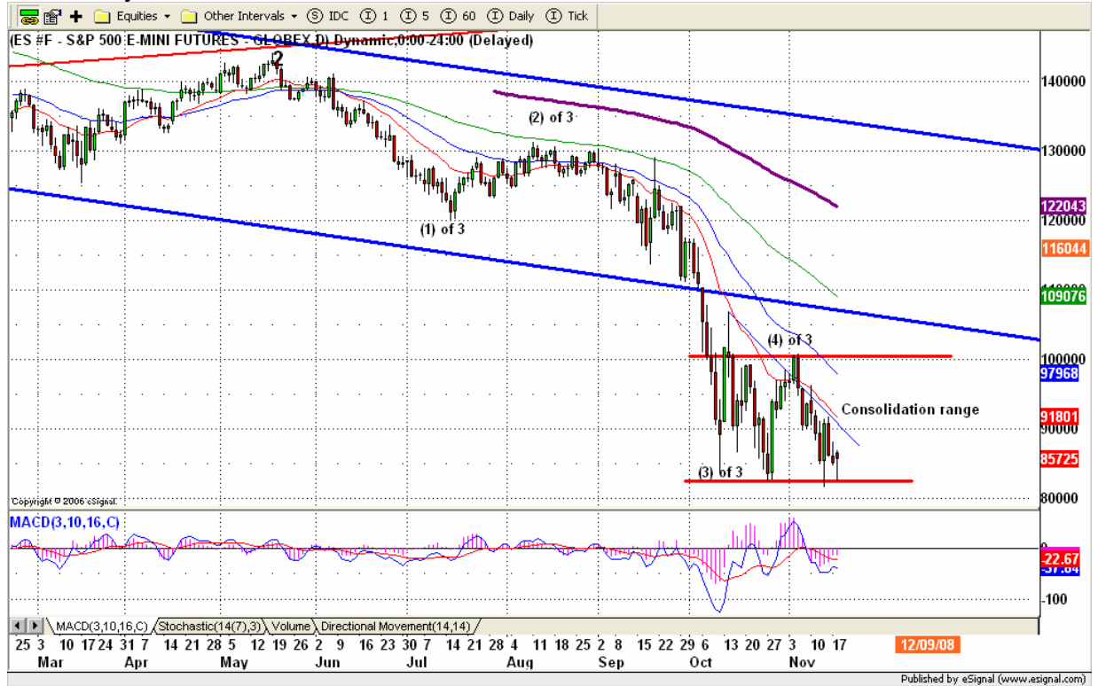
ESZ8 Daily Chart

We saw a rally in last hour trading yesterday. Is it a true rally? That was only a bounce from daily range low. If today ES can't move above 918 line, the major trend remains on the downside until we see the sub-wave 5 completed.