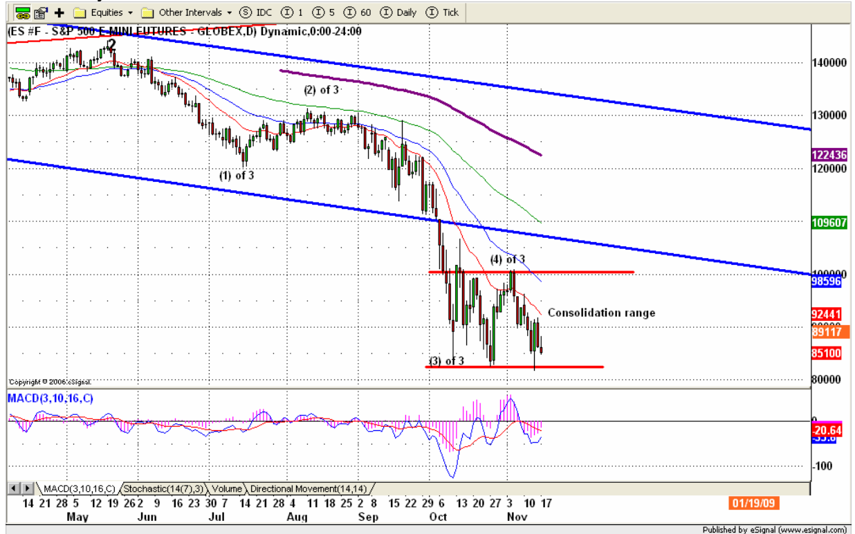
ESZ8 Daily Chart

The sub-wave 5 down of big wave 3 is underway. This sub-wave 5 hasn't completed yet, which means ES should make new lows before it bounces again. There are two possibilities. If bearish symmetrical pattern counts, the downside destination area could be around 768 or lower to 733 area. But if the sideways bottom area counts, the lows could be around 800-798 range. No matter which one, new lows lie ahead.