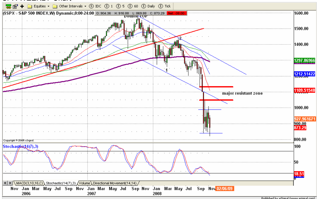
SPX WEEKLY Chart

Major monthly resistance level is 1225 and major support level is 750 Major weekly resistance level is 951 and support level 750