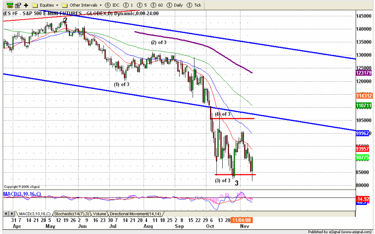
ESZ8 Daily Chart

ES shook out weak buying hands first in the morning trading session and bounced up sharply for closing. Is this rally real? Have we seen the bottom? The answer is maybe not. ES is on sideways movement. As long as ES doesn't move above 951 for closing today, the trend remains on the downside.