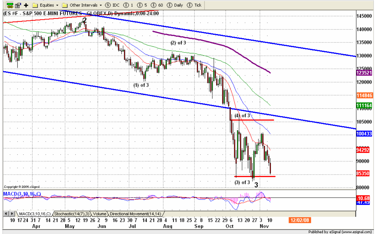
ESZ8 Daily Chart

ES made a continuation low movement yesterday and closed at low trading range. Today we may see a little low movement to retest October's low and later reversal. Yesterday last hour orderly selling came from hedge fund liquidation. As soon as they are done, the short term bounce should be expected.