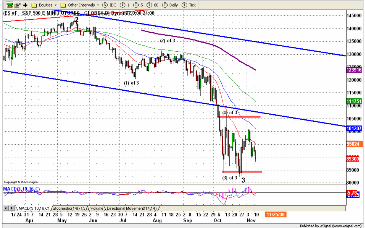
ESZ8 Daily Chart

ES gapped down at open and was unable to fill yesterday's gap. It also lost 900 support line for closing. That is bearish sign, but due to bond market being closed yesterday, it may not be a true sign. Today as long as yesterday's gap holds ES down, the lower levels 875 or lower to 850 area remain possible.