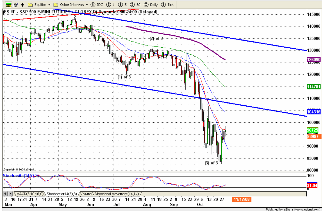
ESZ8 DAILY Chart

ES broke its intermediate-term downtrend line, and closed below its daily resistance level. For short-term, it is overbought. And there was light volume accompanying upside move, which indicates buyers still are nervous, and the rally only came from short-covering. Therefore, we may see a sell off move today to smooth out the overbought condition.