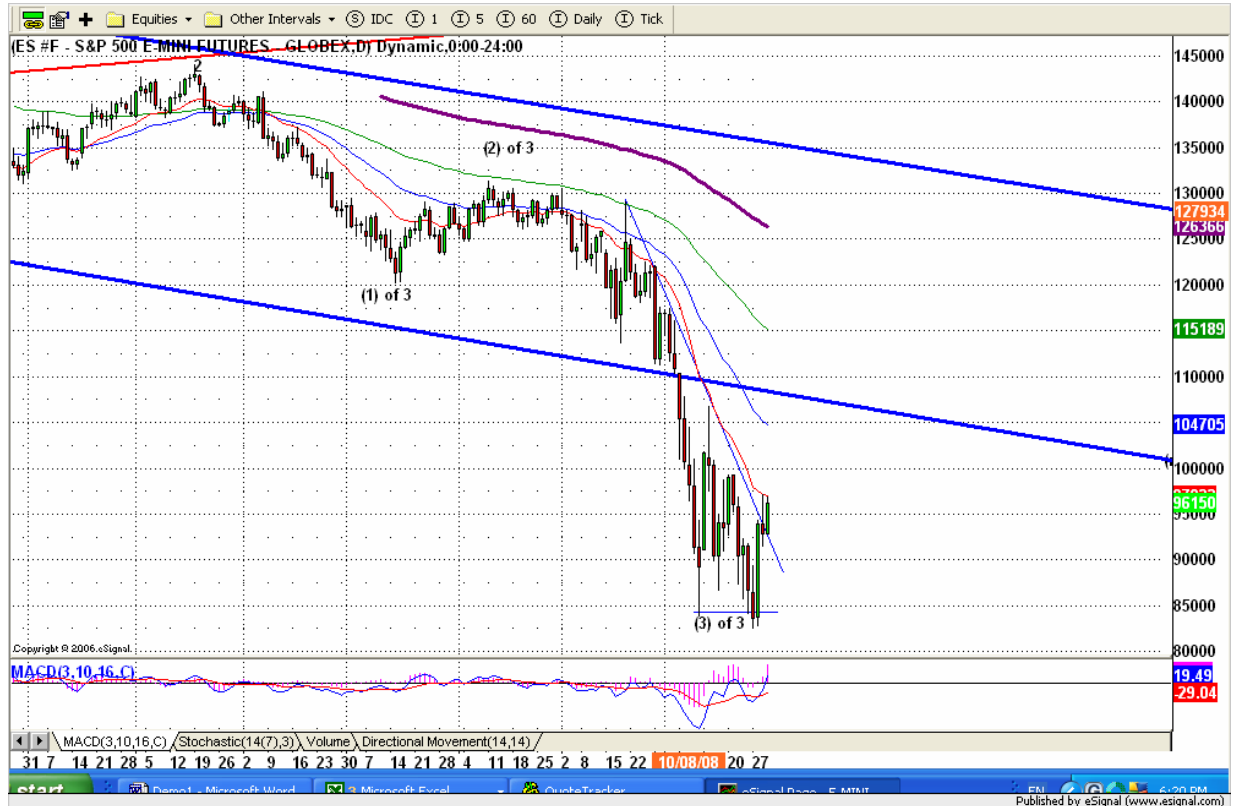
ESZ8 Daily Chart

ES holds up above its downtrend line, but it remains under 20 day moving average line. Today we may see a fake breakout move due to the last day of the month. But daily Grail sell setting should be formed for next week.