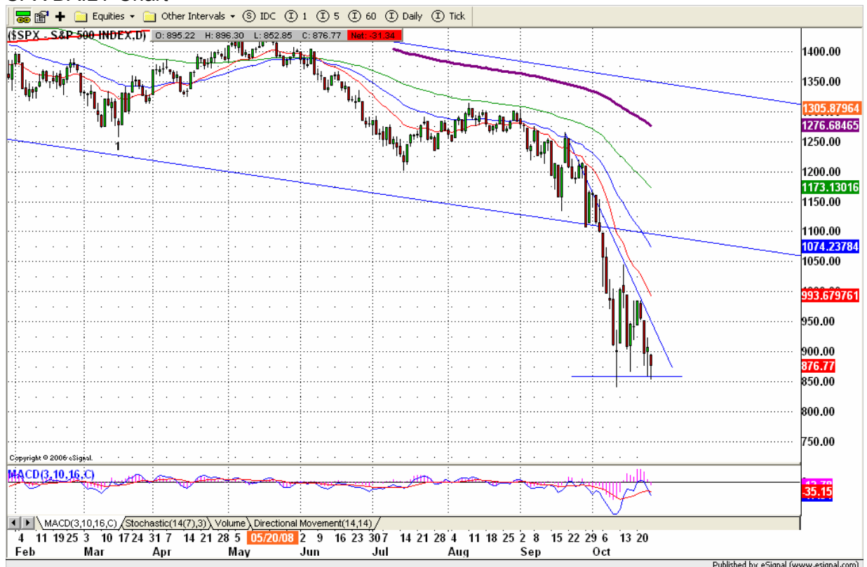
SPX DAILY Chart

Major monthly resistance level is 1221 and major support level is 750 Major weekly resistance level is 1060.75 and support level 750