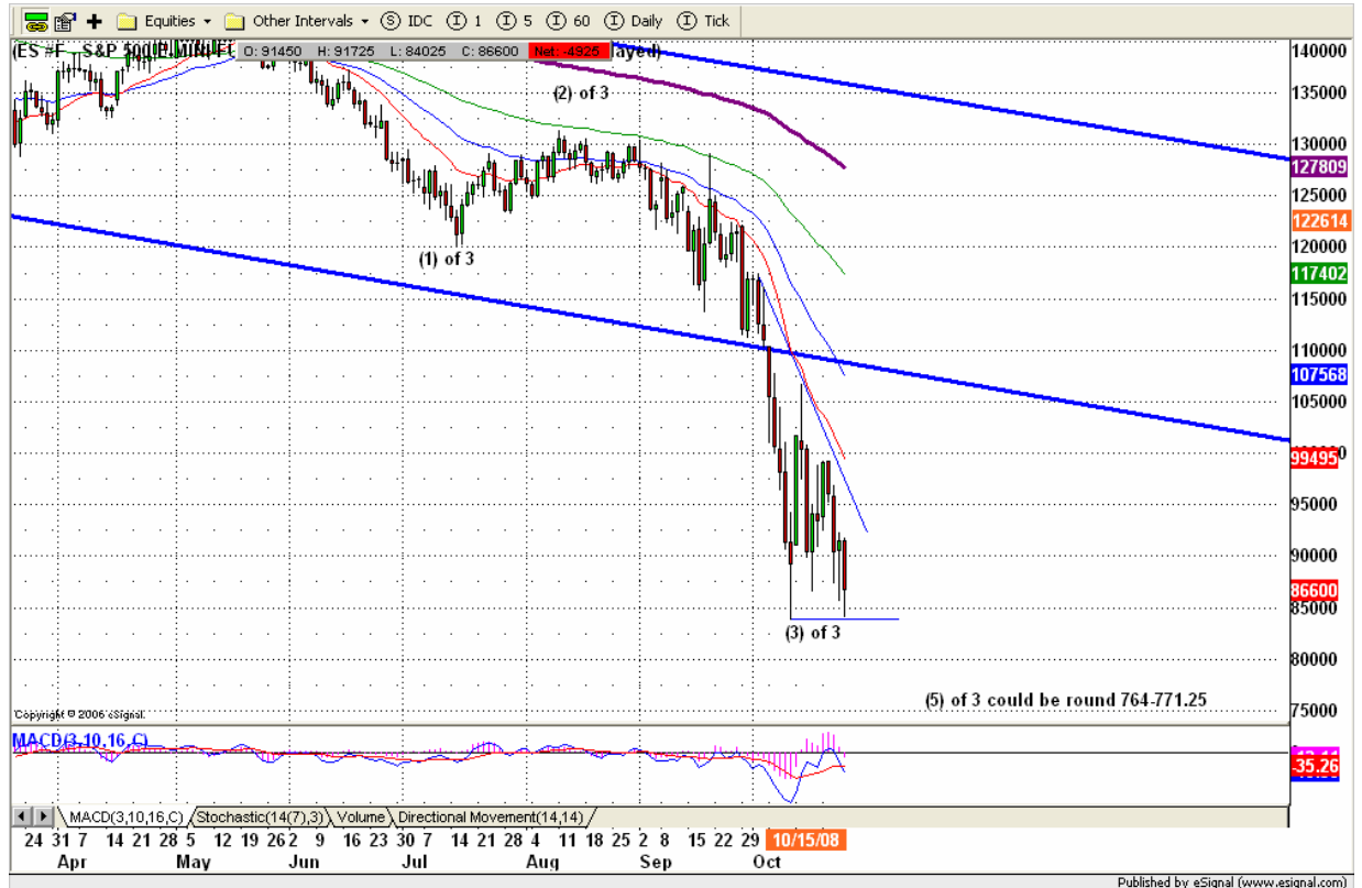
ESZ8 DAILY Chart

Because ES has already been down more than 65% from 2007 peak, it is near the bottom and in extremely oversold condition, so a sharp rally should be expected anytime, especially before Oct 29.