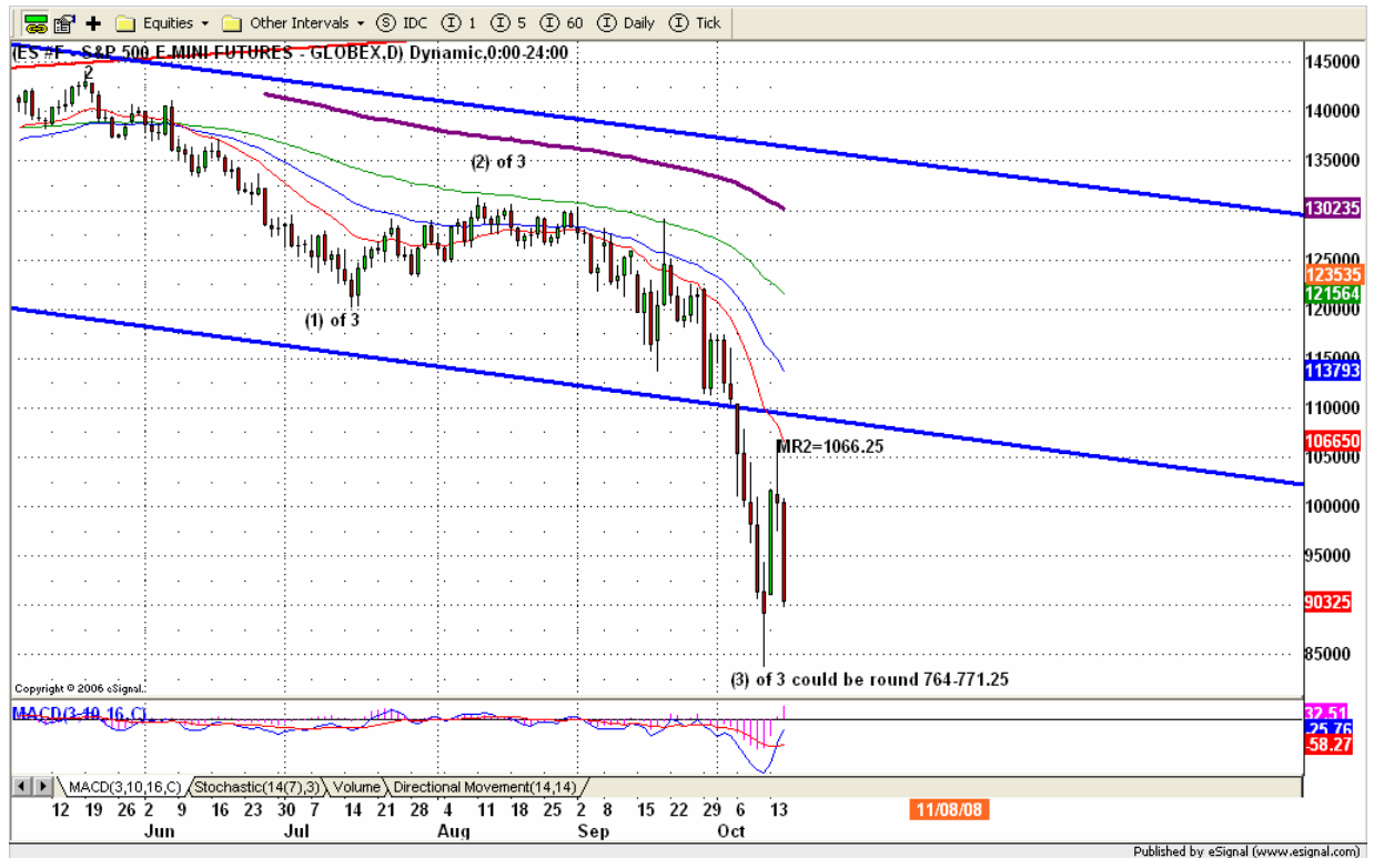
ESZ8 Daily Chart

The bear market remains alive. Yesterday's strong selling pressure pushed ES into the critical level, where price could go either direction. Also today's early reports will either help ES to hold price up or push price down further. If ES can hold price 877-855 range in the early morning session, ES has one more change to push price back up 950-945 range. A move below 850 will be bearish, it indicates sub-wave 4 was completed and declining sub-wave 5 is likely underway.