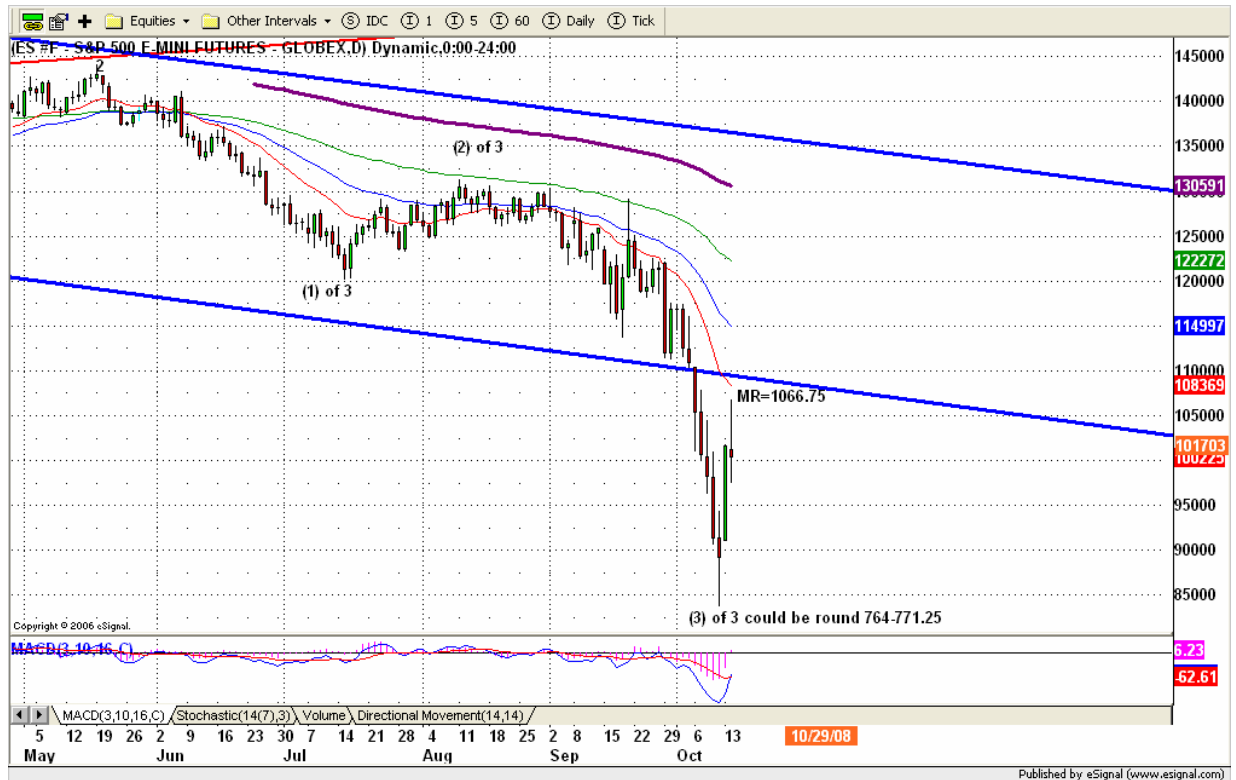
ESZ8 Daily Chart

AS I said Monday, the current rally could be sub-wave 4 or big wave 4. If it is a sub-wave 4, the top could be either 1053-1073 or higher to 1141.50 area. If it is big wave 4, the top could be 1141.50 or higher to 1213.50-1211.75 max area. Once the rally is exhausted, the next leg down in the ongoing bear market will unfold by either retesting 837 level or making new lows.