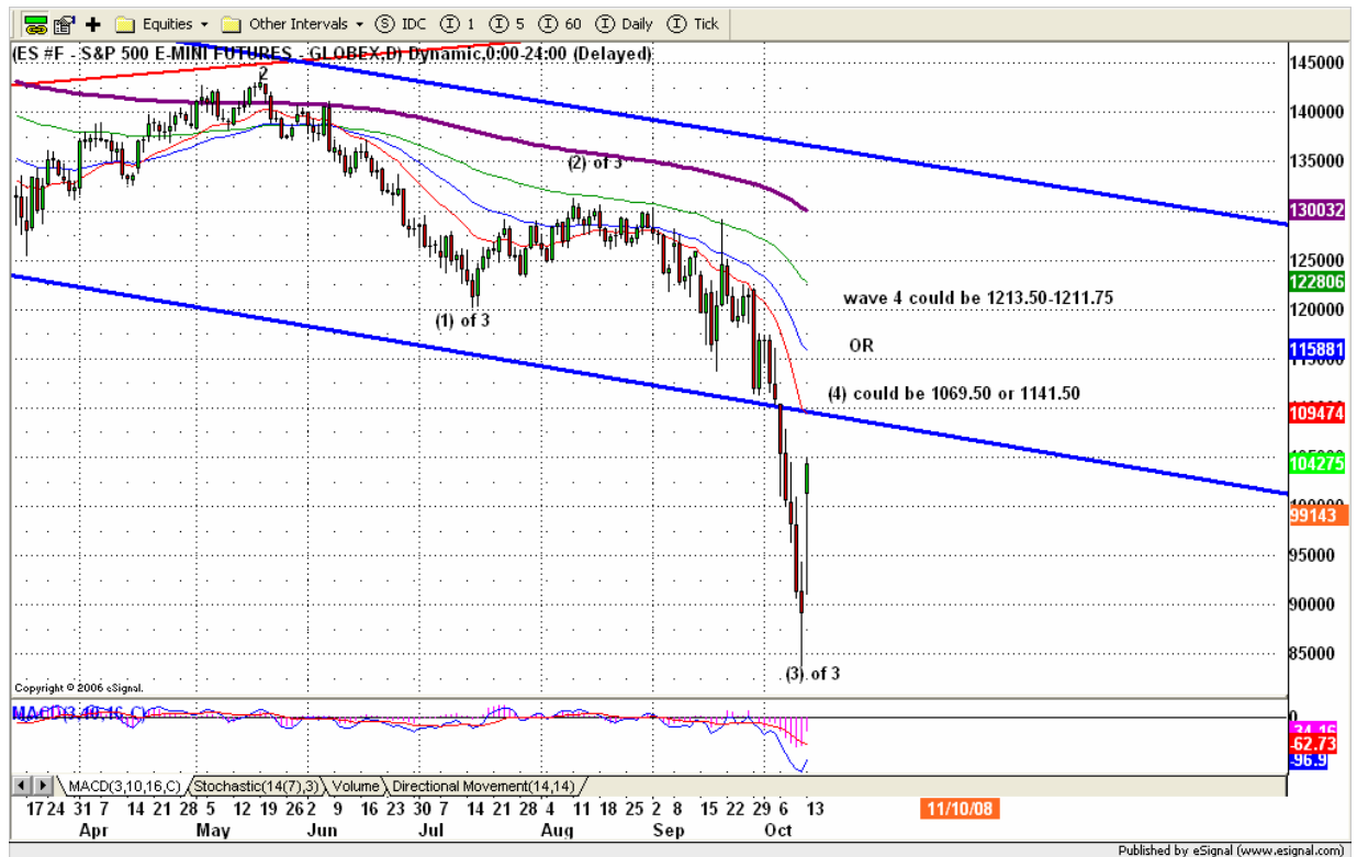
ESZ8 Daily Chart

A countertrend rally started yesterday pre-market. This one was very strong — it gapped up at the open and closed at top range with 125 points from last Friday's closing. So far last Friday's low was confirmed as sub-wave 3 of big wave 3. The current rally could be sub-wave 4 or big wave 4. If it is a sub-wave 4, the top could be either 1053-1073 or higher to 1141.50 area. If it is big wave 4, the top could be 1141.50 or higher to 1213.50-1211.75 max area. Once the rally is exhausted, the next leg down in the ongoing bear market will unfold by either retesting 837 level or making new lows.