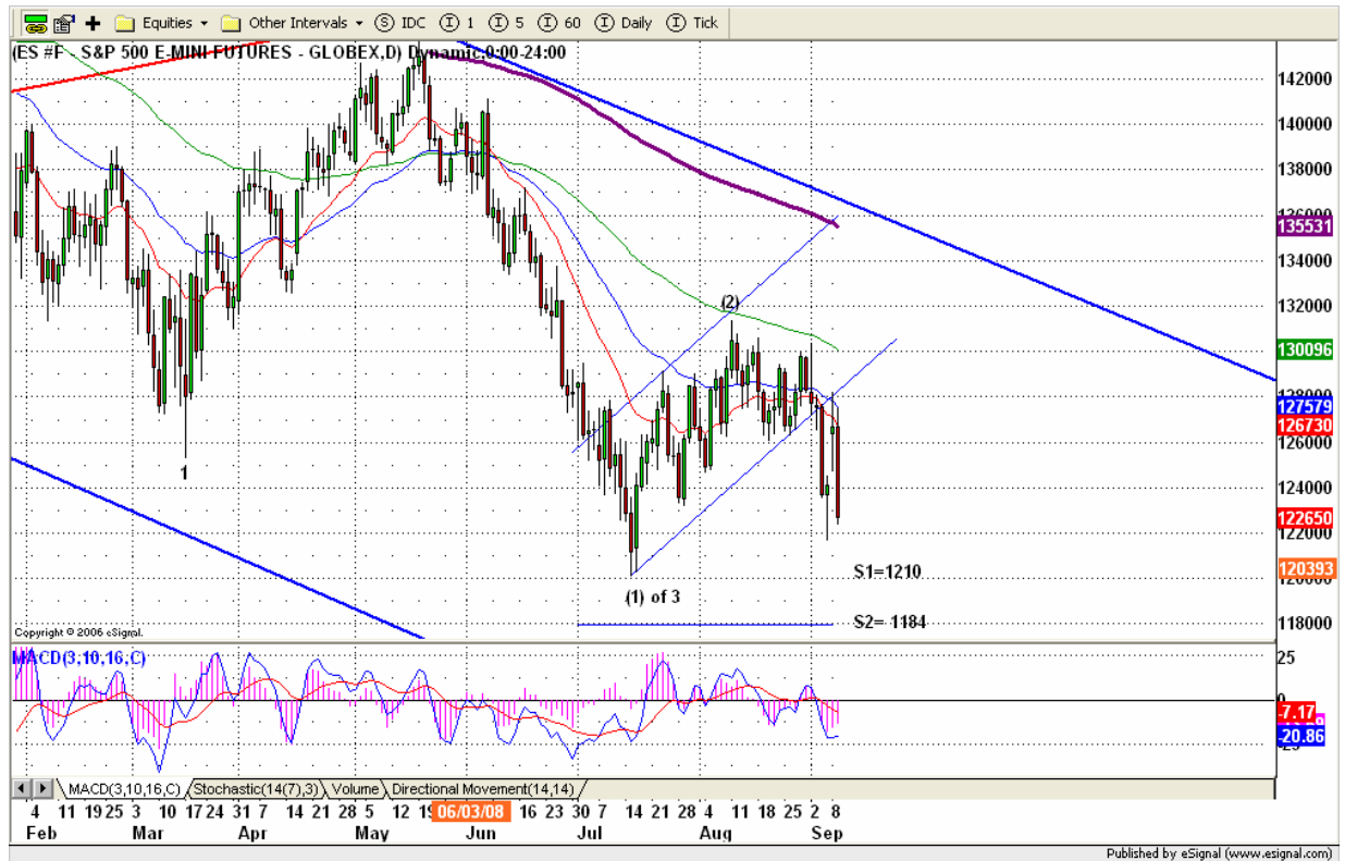
ESU8 Daily Chart

After excitement from bailouts, investors saw only a weak bounce again. Bailouts in a bear market only brings price to go lower than we expect. Wave 3 decline remains intact until it hit its major target. Any bounce can be considered as a dead cat bounce.