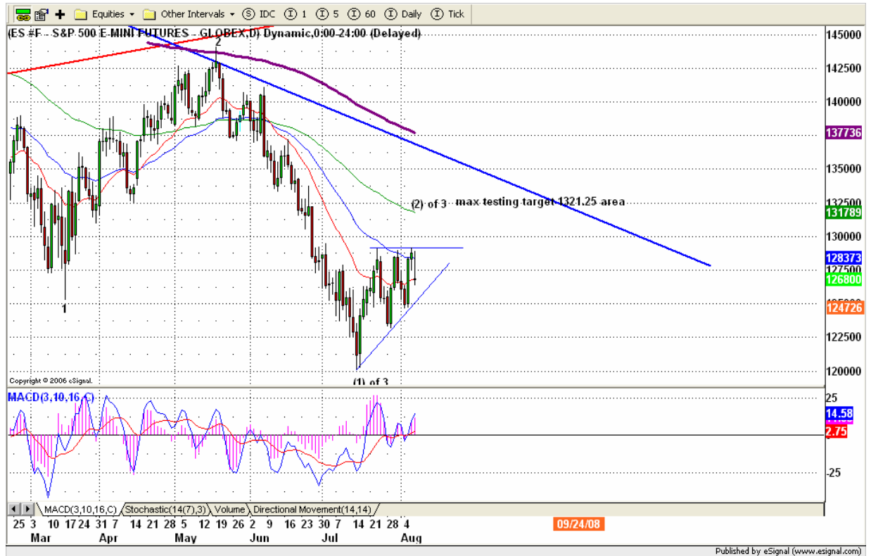
ESU8 Daily Chart

ES is forming an ascending triangle pattern on daily chart. Today and next two days will become key days. Either ES has to breakout upside or downside direction for next trend move. A breakout 1294.75 line will push price straight up to 1321.75. and a move below 1244 line will courage the sellers to push price down to 1233 line. If today there is no breakout attempt, the price still can travel inside triangle for one more day.