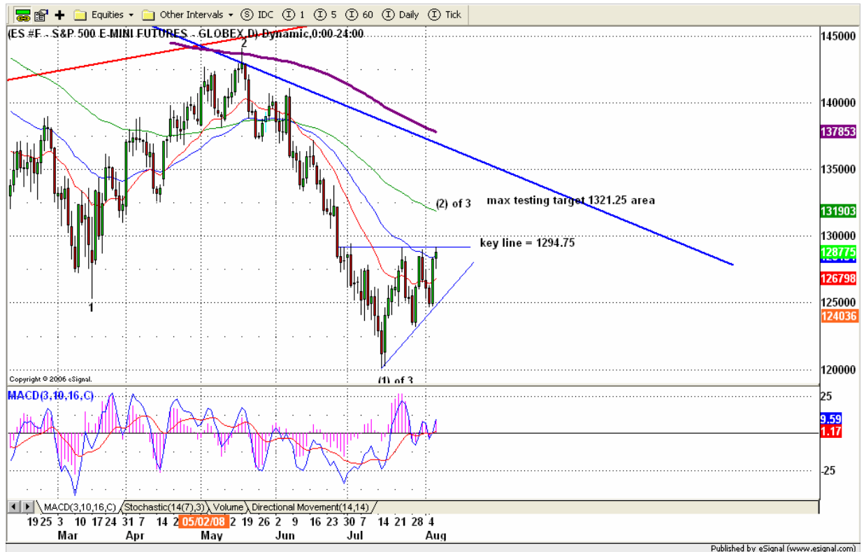
ESU8 Daily Chart

After a small pullback correction, the market made a continuation high move for high range closing. It formed an ascending triangle pattern on daily chart. Today July's high 1294.75 is key line. A break above it will be bullish. It indicates 1322.50 gap will be filled soon in the following days.