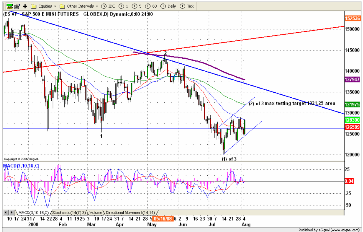
ESU8 Daily Chart

The interest rate remains unchanged. The stock market rallies, fueled by oil slide and Fed statement. ES gapped up at open and managed to hold the gap for big gain at closing. A move above 1285 is bullish. That indicates the sub-wave 2 still hasn't completed yet.