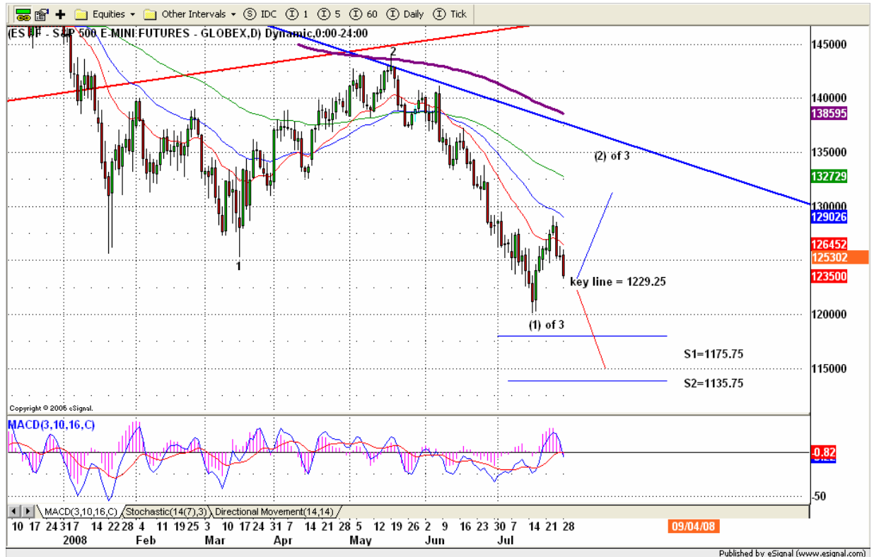
ESU8 Daily Chart

It appears that sub-wave 2 top is already formed, the trend is back into downside track. Today 1229.25 is key. If ES can't hold this line, it is likely for it to move down to 1220-18 or lower to 1208-06.50 range. A continuation low move possibly occurs, but if ES can hold price up above 1229-28 line, and later breakout the first hour range, it could trigger a reversal yo yjr upside.